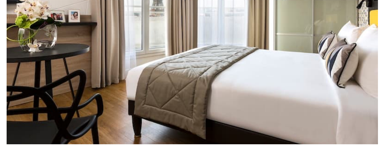
Photo Credit: Citadines Tour Eiffel, Studio Deluxe Eiffel Tower View with Balcony.

Located just a few minutes walk from the Eiffel Tower, <u>Citadines Tour Eiffel</u> offers modern, fully-equipped apartments, some of which offer stunning views of the tower. In the 1-Bedroom Apartment with tower views, you'll find room for four people: one double bed and one double sofa bed, which can be a bit of a rare find in European hotels.